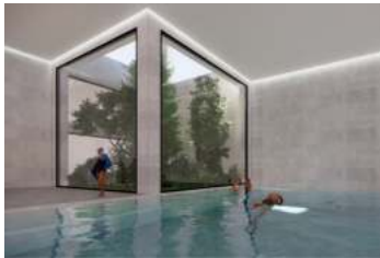
The Underground Pool & Spa

Phnom Penh's first belowground Pool & Spa, for thorough relaxed sensorial experience, completed by an organic poolside bar and lounge. Unexpected.