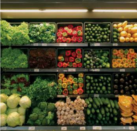
COMMUNITY SUPERMARKET (0,000 sqm)