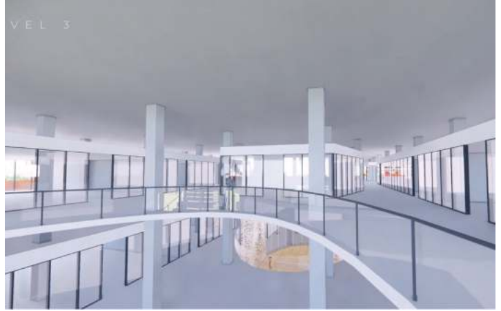
OFFICE SPACES (0,000 sqm)