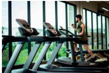
The Sports floor

Phnom Penh's first belowground Pool & Spa, for thorough relaxed sensorial experience, completed by an organic poolside bar and lounge. Unexpected.