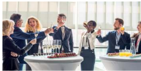
Open Event Spaces

Boutique rooms resembling no others, where living, sleeping and distant-working volumes are reshuffled.