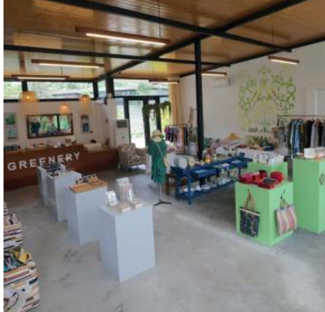
LIFESTYLE SHOPPING (0,000 sqm)