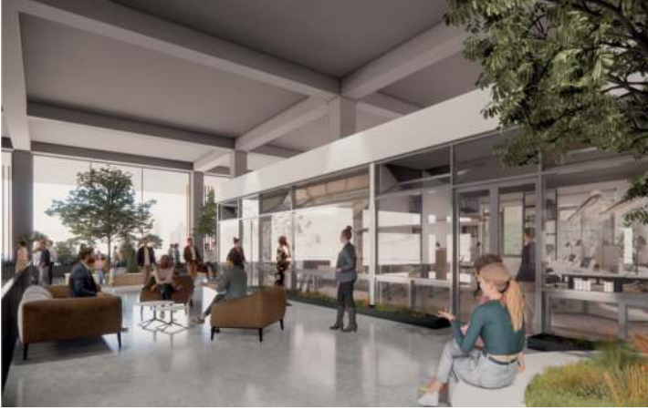
OPEN PUBLIC AREAS (0,000 sqm)